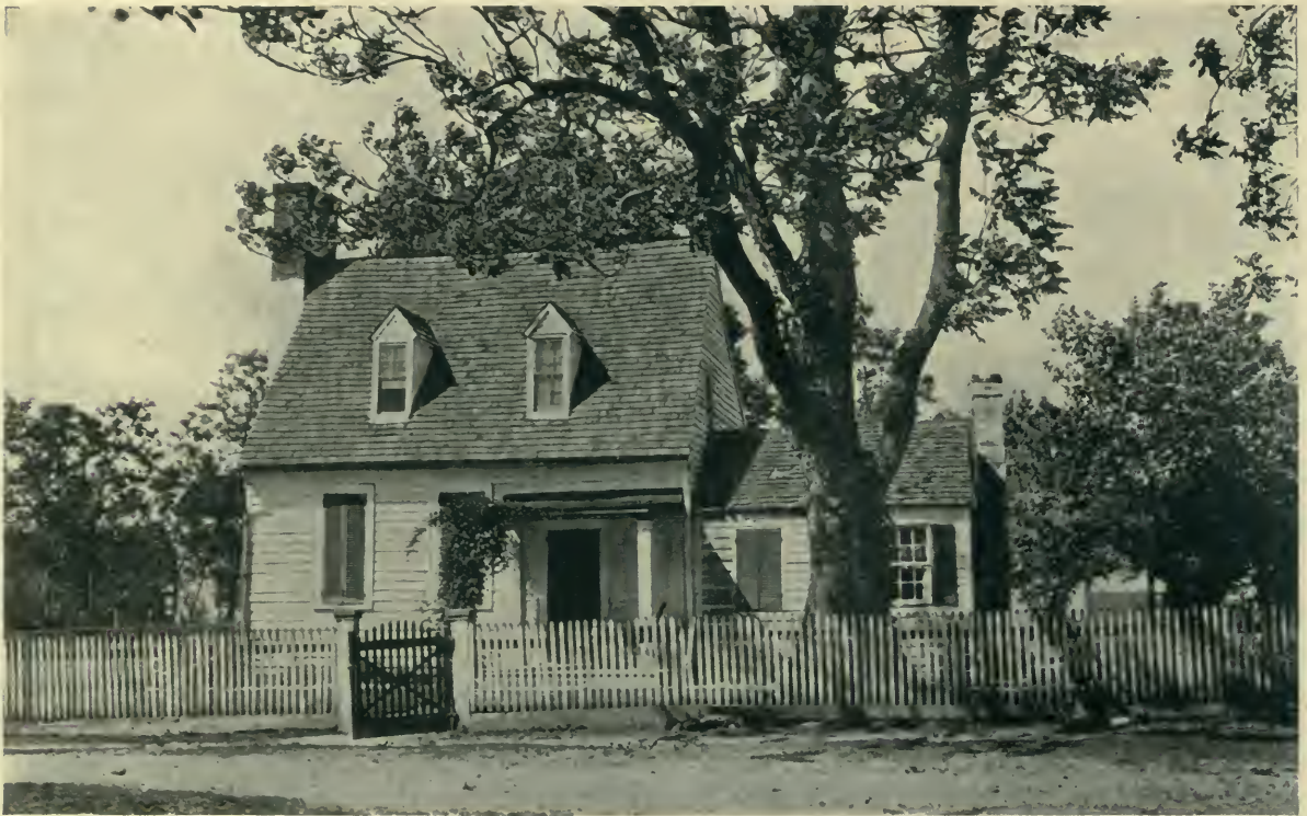
AN EARLY COTTAGE, FALMOUTH, VIRGINIA

Long dormers with sharp-peaked gables are characteristic of the early Southern houses